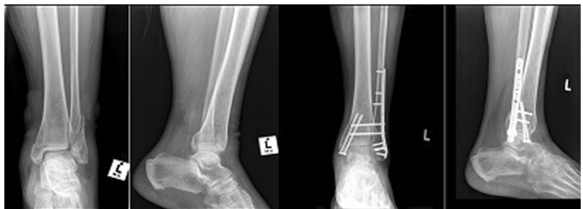
Fig. 7 Weber C fracture pattern (a) stabilized with anatomical lock plate (b)

Data is expressed as median and interquartile ranges, with the total number of participants with non-missing data indicated in parentheses