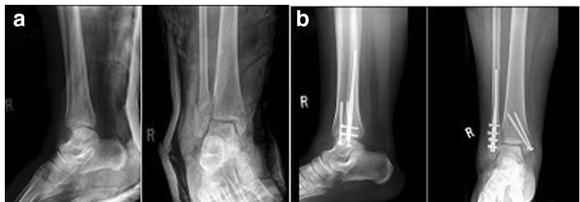
Fig. 5 Weber B fracture pattern (a) stabilized with fibula nail (b)

There was no difference between plantar- and dorsiflexion between the groups in the unaffected leg and similarly, no differences between plantar- and dorsiflexion between the plate group and nail group were observed at any of the follow-up visits (Supplementary Figs. 1 & 2). There were however significant differences at various time points between the unaffected and affected leg within each group, as can be expected (Supplementary Figs. 1 and 2). Similarly, there were no differences between inversion and eversion ranges between the plate group and nail group in the unaffected leg, and no differences between the groups were observed at any of the follow-up visits in inversion and eversion (Supplementary Figs. 3 and 4). Significant differences during the healing phase were observed between the unaffected and affected leg, throughout the study period. Both groups had 100% union rates with no loss of initial reduction.