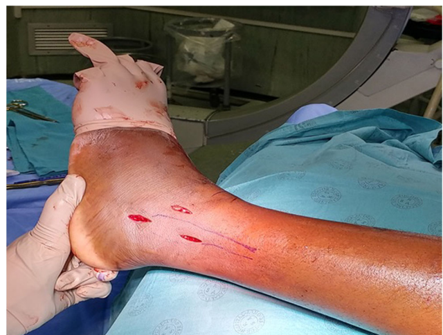
Fig. 2 Intra-operative incisions for nail insertion and fixation

The proximal and distal screws were inserted to enable rotation of the fibula as it lies within the incisura of the tibia. The same criteria for syndesmotic instability used in the plate group, was applied to the nail group. With an unstable syndesmotic injury, the jig was used to “rock” the nail with one hand, whilst the other hand was used to palpate the fibula position in the tibial incisura. This technique enabled palpation of where the “sweet spot” was to insert the syndesmotic screw. A single or two fully threaded syndesmotic screws was inserted through the nail across three cortices.