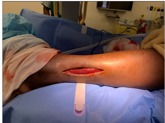
Fig. 1 Intra-operative incisions for plate fixation

Plating was performed using AO technique for locking plate fixation (Fig. 1). The Acumed (Acumed, Oregon, USA) anatomical contoured plate was used. Syndesmosis integrity evaluated using the Burwell and Charnley criteria [8]. A tibiofibular clear space increased of \geq 1 mm was deemed unstable, and a syndesmotic screw was inserted.