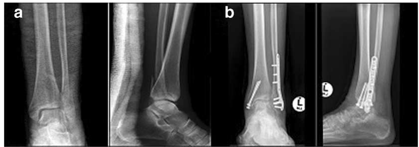
Fig. 4 Weber B fracture pattern (a) stabilized with anatomical locked plate (b)

A return to baseline soft tissue circumference was observed at the 12-month follow-up in the nail group (Fig. 6) with a mean soft tissue malleolus circumference of 26.3 \pm 2.6 cm in the affected leg versus 25.6 \pm 2.1 cm in the unaffected leg (a mean difference of 0.7 cm) compared with 26.8 \pm 1.7 cm in the affected leg versus 25.1 \pm 2.3 cm in the unaffected leg (a mean difference of 1.7 cm) in the plate group. No differences were however observed in soft tissue malleolus circumference between the two groups at the 6-week, 3-, 6- and 12-month follow-up visits ( p = 0.774 , p = 0.214 , p = 0.546 and p = 0.421 , respectively) (Supplementary Table 3). No significant differences in functional scores, as measured by the Olerud and Molander scoring system or in the Grimby score at 3-, 6- and 12-months were observed (Table 3). Figures 7 and 8 illustrate Weber C fractures stabilized with a fibula nail and anatomical contoured lock plate.